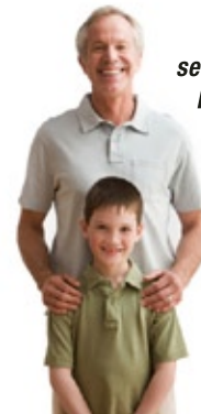
senior citizens & kids can operate!!